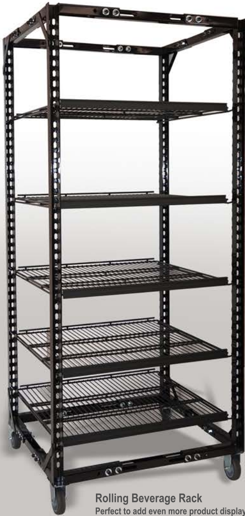
Rolling Beverage Rack Perfect to add even more product display behind an all-glass entry door.