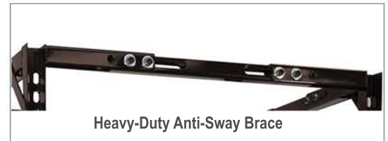
Heavy-Duty Anti-Sway Brace