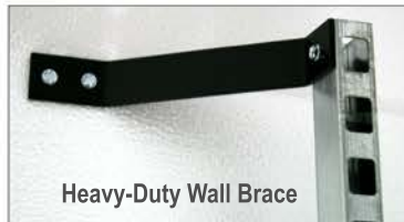
Heavy-Duty Wall Brace

We carry the perfect assortment of shelves that will accommodate and properly display your products. Available in white or black finish.