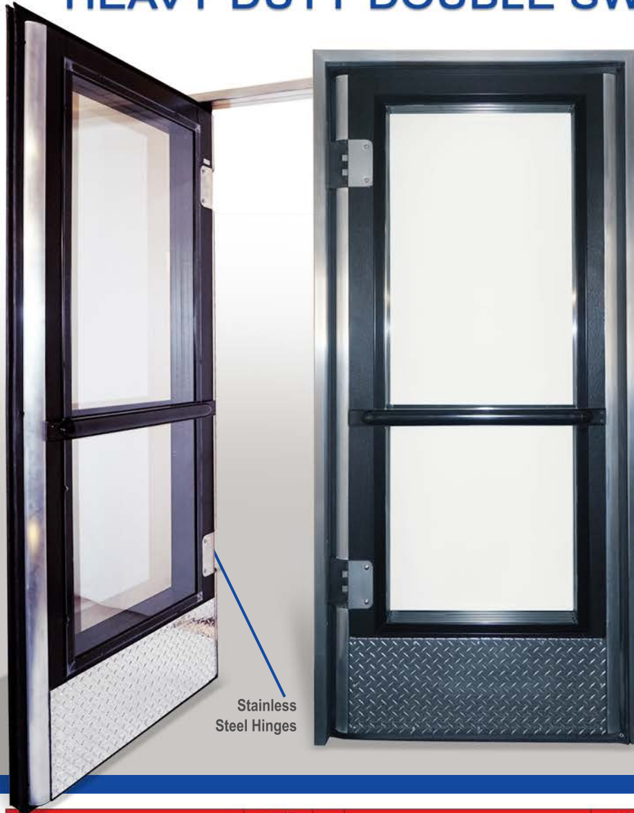
Stainless Steel Hinges

There is no other door manufactured today that compares to the heavy duty construction of the CDS Cave Door. Designed for high volume, high traffic Beer Cave applications the superior Heavy Duty construction will stand up in the toughest environments. Whether it is the delivery driver slamming into the door with his 2 wheeler or the customer ramming the door with a shopping cart the CDS Heavy Duty Cave door is engineered to take the beating and perform like the day it was first installed.