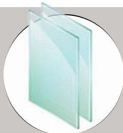
2 pane glass

Note: CDS is the only door company with serviceable and repairable doors when compared to the low-end throw-away non-serviceable doors offered by other companies.