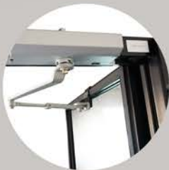
90 degree hold open