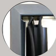
Double Door Gasket