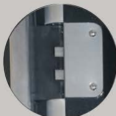
Heavy Duty Composi/Stainless Steel Hinges