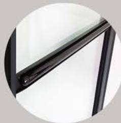
Push Bar with Rubber insert