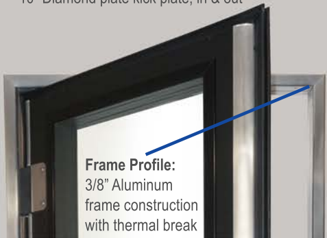
Frame Profile: 3/8" Aluminum frame construction with thermal break