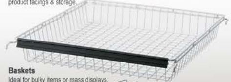
Baskets Ideal for bulky items or mass displays.