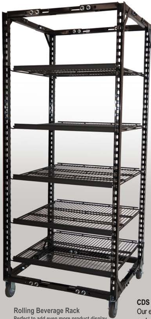
Rolling Beverage Rack Perfect to add even more product display behind an all-glass entry door.