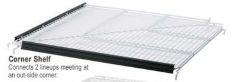
Corner Shelf Connects 2 lineups meeting at an out-side corner.

Our exclusive shelving design provides a full width non-notched shelf which gives you increased product facings and storage. The bow truss system eliminates shelf sag making the CDS shelf the strongest shelving system on the market.