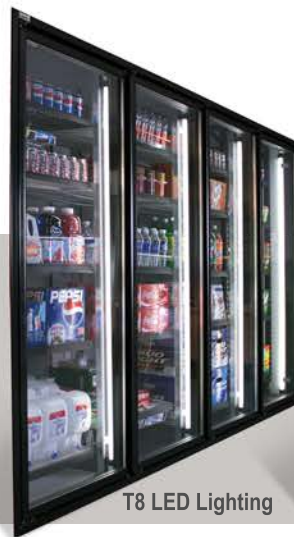
T8 LED Lighting