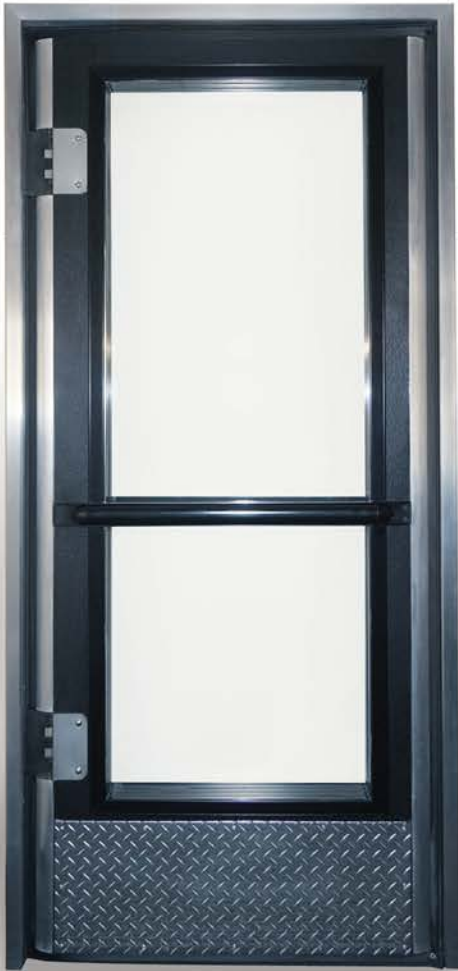
Heavy Duty Double Action Cave Door Energy Free with a 3" Insulated Door