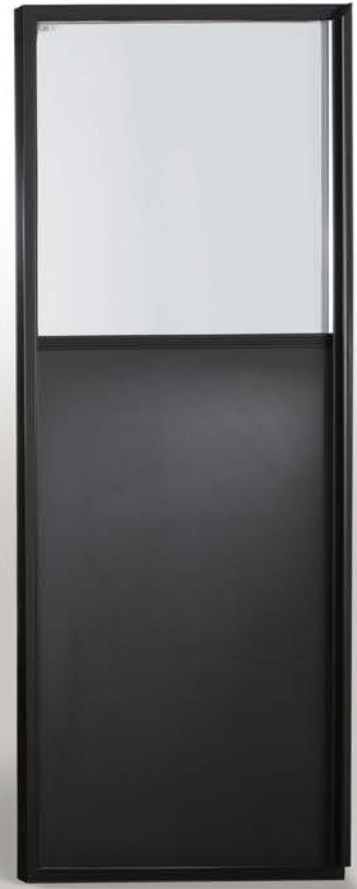
Entrance Doors - 1/3 Glass

Quality Entrance Cooler Doors from CDS can add the finishing touches to your store environment. Doors come with 2 pane non heated glass, optional Low E Gas Filled (2 or 3 Pane) Glass Package are available. Black or Silver, and you can add a Stainless Steel Kick plate. Optional Doors are available for coolers in many standard sizes but can also be made to fit custom openings if required.