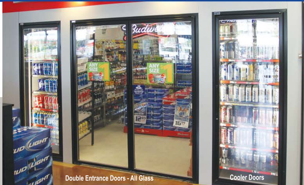
Double Entrance Doors - All Glass