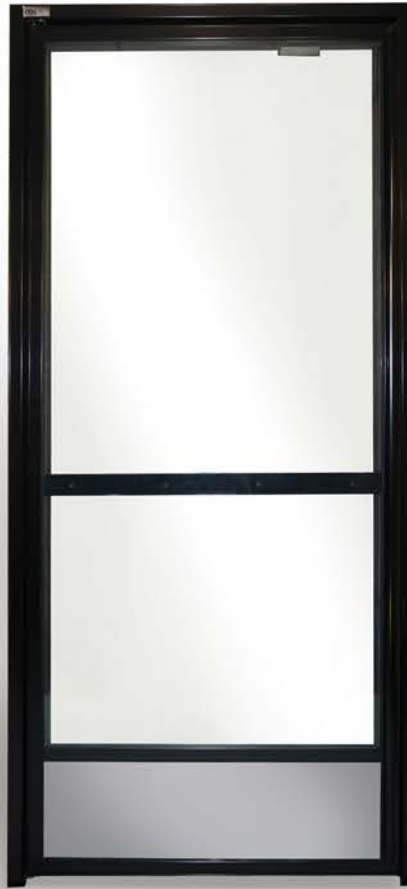
Entrance Doors All Glass (shown with optional push bar and kick plate)