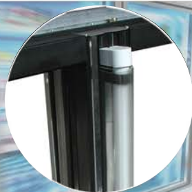
T8 LED Lighting