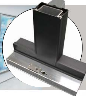
Flat Mullion Design - Superior Insulation

Phone: (800) 478-3790 Phone: (818) 361-8160 Fax: (818) 361-8152 www.cdsdoors.net 17341 Sierra Highway Canyon Country CA 91351