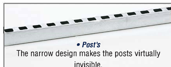
• Post's The narrow design makes the posts virtually invisible.