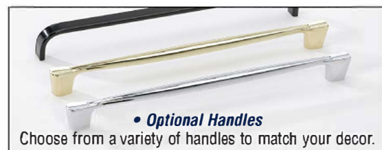
• Optional Handles Choose from a variety of handles to match your decor.