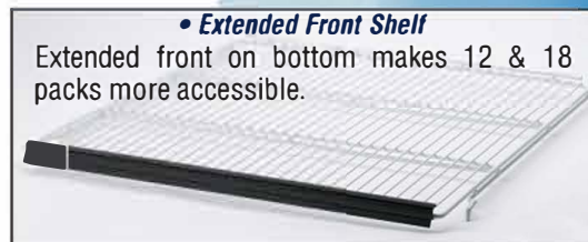
• Extended Front Shelf Extended front on bottom makes 12 & 18 packs more accessible.