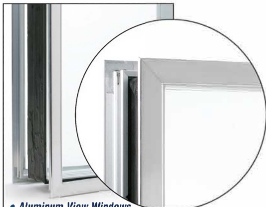
• Aluminum View Windows Heated & non-heated.