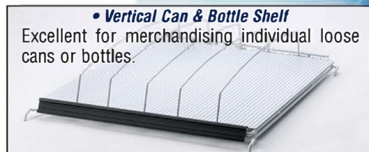
• Vertical Can & Bottle Shelf Excellent for merchandising individual loose cans or bottles.