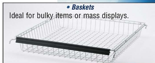
• Baskets Ideal for bulky items or mass displays.