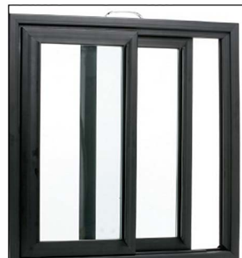
• PVC Sliders For normal temp applications.

The exclusive CDS shelving design provides a full width shelf, which gives you increased product facings and storage. The bow truss system eliminates shelf sag making the CDS shelf the strongest shelving system on the market.