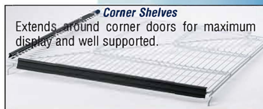
• Corner Shelves Extends around corner doors for maximum display and well supported.