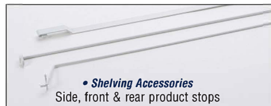
• Shelving Accessories Side, front & rear product stops

Smooth & Serrated Silver & Gold, Black, Satin Silver