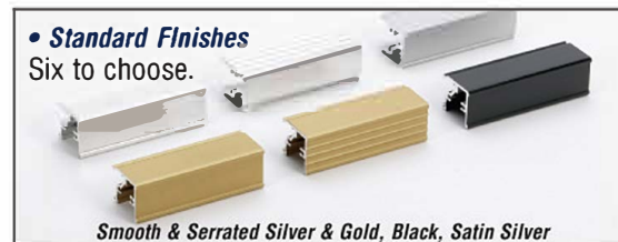
• Standard Finishes Six to choose.

Smooth & Serrated Silver & Gold, Black, Satin Silver