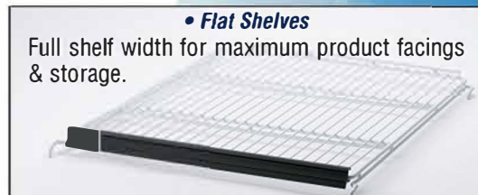
• Flat Shelves Full shelf width for maximum product facings & storage.