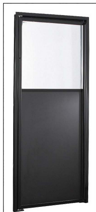
• Entrance Door Available in all glass, solid panel or 1/3 - 2/3 glass/solid panel designs. Available with roll-away beverage rack.