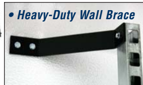
• Heavy-Duty Wall Brace

ROLLER RACK SHELF Eliminate the need to constantly face your product, increase the holding capacity, combine both sizes and the Vertical Can and Bottle shelf for the flexibility you need to minimize your labor cost and maximize your profits.