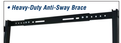
• Heavy-Duty Anti-Sway Brace

CDS Products are covered by Patent: 6,798,516.