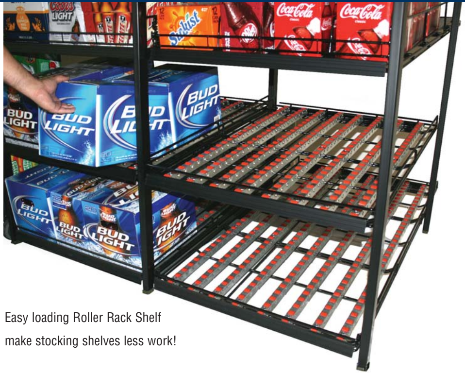
Easy loading Roller Rack Shelf make stocking shelves less work!

The bow truss system combined with welded front and side stops eliminates shelf sag add the heavy duty Anti-Sway brace and the Heavy-Duty Wall Brace and you will see why the CDS Shelving system is the strongest system on the market today. Increase capacity and gravity feed means less labor increased sales and increased profits. The shelf is available in 37", 43" and 49" depths and you can combine both size shelves to work in the same door. Roller track shelving is currently only available for 30" wide doors.