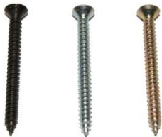
Installation Screw Part No. 10099 $6.50