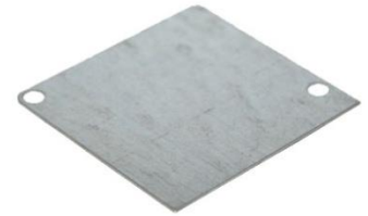
End Cap End Part No. 10036 $10.00