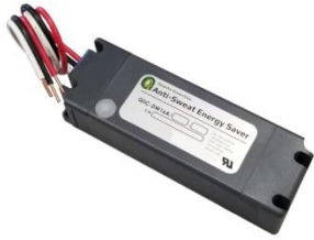
Heater Controller Part No. 10545-C $1,273.00 9/26/18 Thru Present