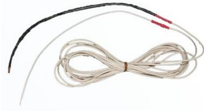
Frame Heater Assy. Part No. 10077F $106.00