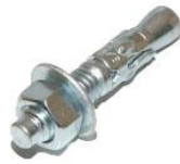
Anchor Bolt 3/8-16X2-1/4 Part No. 10102 $13.50