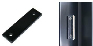
Frame End Lock Strike Part No. 10437 $10.00