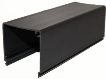
Raceway Cover* Part No. 10013 $17.75p/ft