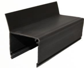
End Cover LED* Part No. 10325 $28.50p/ft