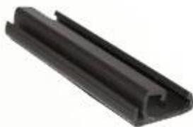
Plate Retainer* Legacy & Adv Frame Part No. 10016 $10.50p/ft