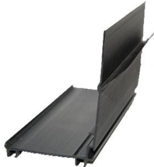
Frame Cover Low Temp* Part No. 10023 $35.50