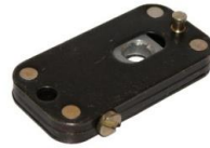
Kwik Level Part No. 10112 $50.50