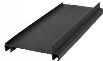
Endless Frame Cover* Part No. 10015 $25.00p/ft