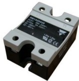
Heater Relay Part No. 10286 $282.00