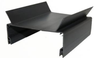
Rear Mullion Cover LED* Part No. 10324 $35.50p/ft