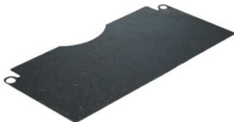
End Cap Center Flat Part No. 10035-F $10.00