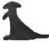
Plate Holder Part No. 10017 $10.50p/ft