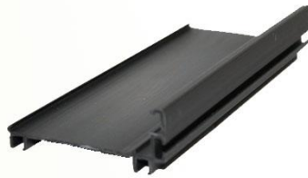
Econo Cover* Part No. 10014 $25.00p/ft