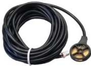
Sensor Part No. 10545-S $370.50 9/26/18 Thru Present