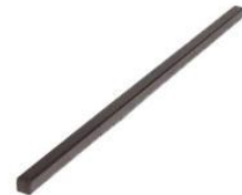
Torque Lever 1/8"X1/8" Part No. 10042-3 $10.000