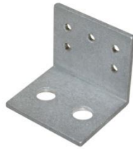
Entrance Dr Frame Anchor Part No. 10524 $37.50