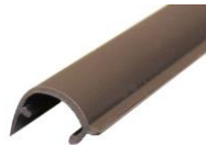
Plate Retainer* Adv Center Mullion Part No. 10058 $10.50p/ft