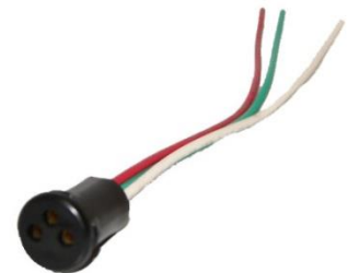
Heater Plug Female Part No. 10054 $52.00