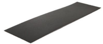
Contact Plate* Legacy 1.600" Part No. 10041-1 $17.75p/ft Advantage 3.280" Part No. 10041-2 $35.50p/ft