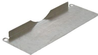
End Cap Center Bent Part No. 10035-B $10.00