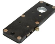
Kwik Torque w/o Pin (Legacy 11/2007 to Present Advantage 2/2008 to Present) Part No. 10113 $54.50