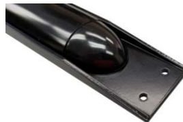
Bumper Bar Black Only Part No. 10239-B $413.50