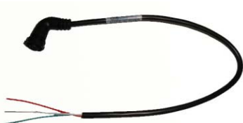
Heater Plug Advantage Part No. 10247 $87.00