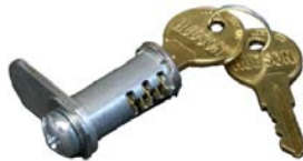
Door Lock Part No. 10047 $79.00