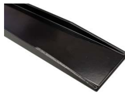
Door Guard Black Only Part No. 10239-G $80.50