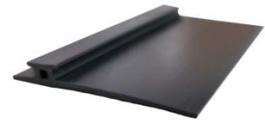
Door Seal Flap Ctr Pull* Part No. 10507 $16.75p/ft