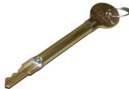
FLH Lock Key Part No. 10525 $49.00