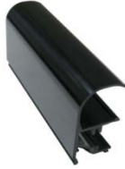
Full Length Handle Door Rail

Part No. 10184-P $33.00p/ft Part No. 10184-B $33.00p/ft Part No. 10184-S $33.00p/ft Part No. 10184-G $33.00p/ft