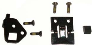
Hold Open Kit H.L. Feb. 2006 thru Present Part No. 10298-L $51.00