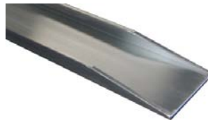
Door Guard Part No. 10239-G $62.00