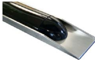
Bumper Bar Part No. 10239-B $313.00